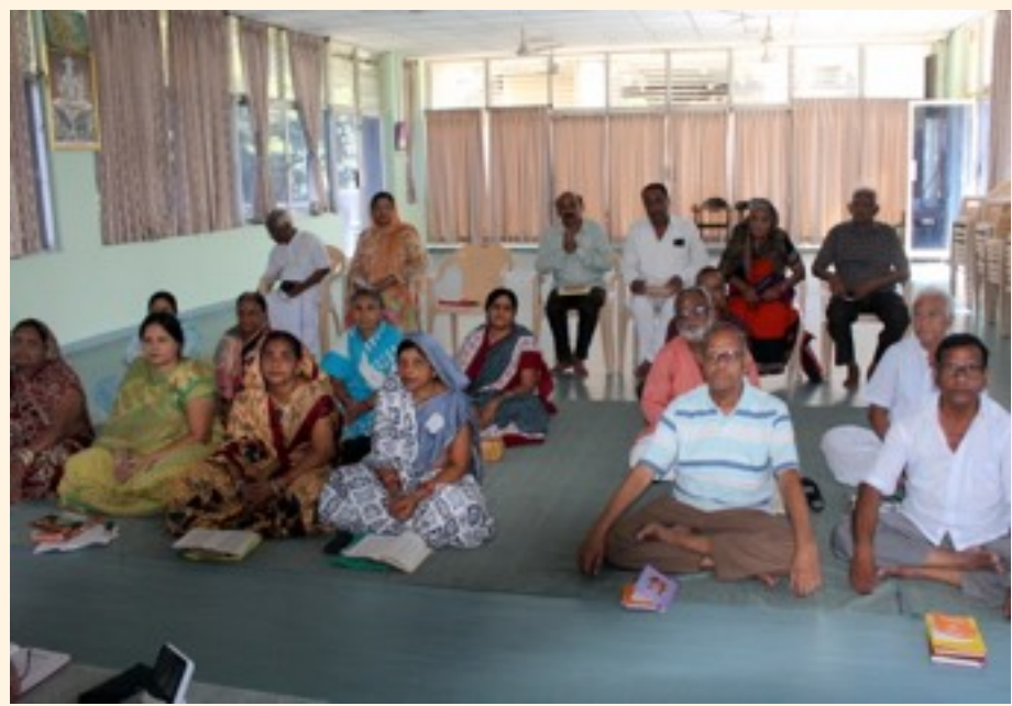
Class session under progress

Most of the students had come to the Gurukulam for the first time. They were enchanted by the calm and quiet surroundings of the ashram. The greenery of dense forest, constantly blowing cool breeze, dancing peacocks, tweeting of the birds took the campers to a different world. They were transported from the world of tears and turmoil to a world of peace and serenity. The students unanimously agreed that this was the best place for studying Vedanta.